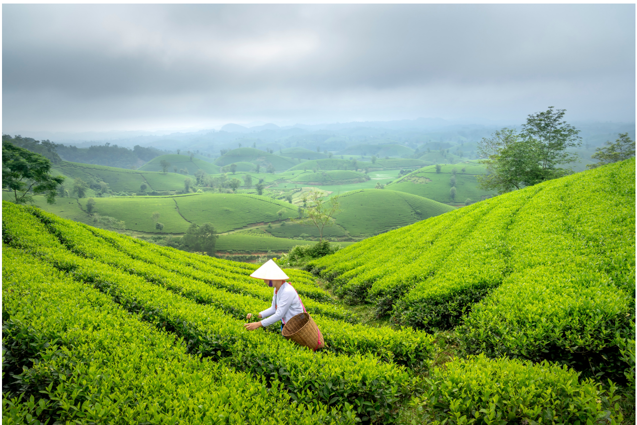
A woman farmer harvests tea leaves

The objective of a proposed Transformational AVC Guidelines is to enable small-scale producers to overcome barriers to development through more inclusive AVCs in the food, agriculture, and forestry sectors toward contributing to the attainment of the SDGs.