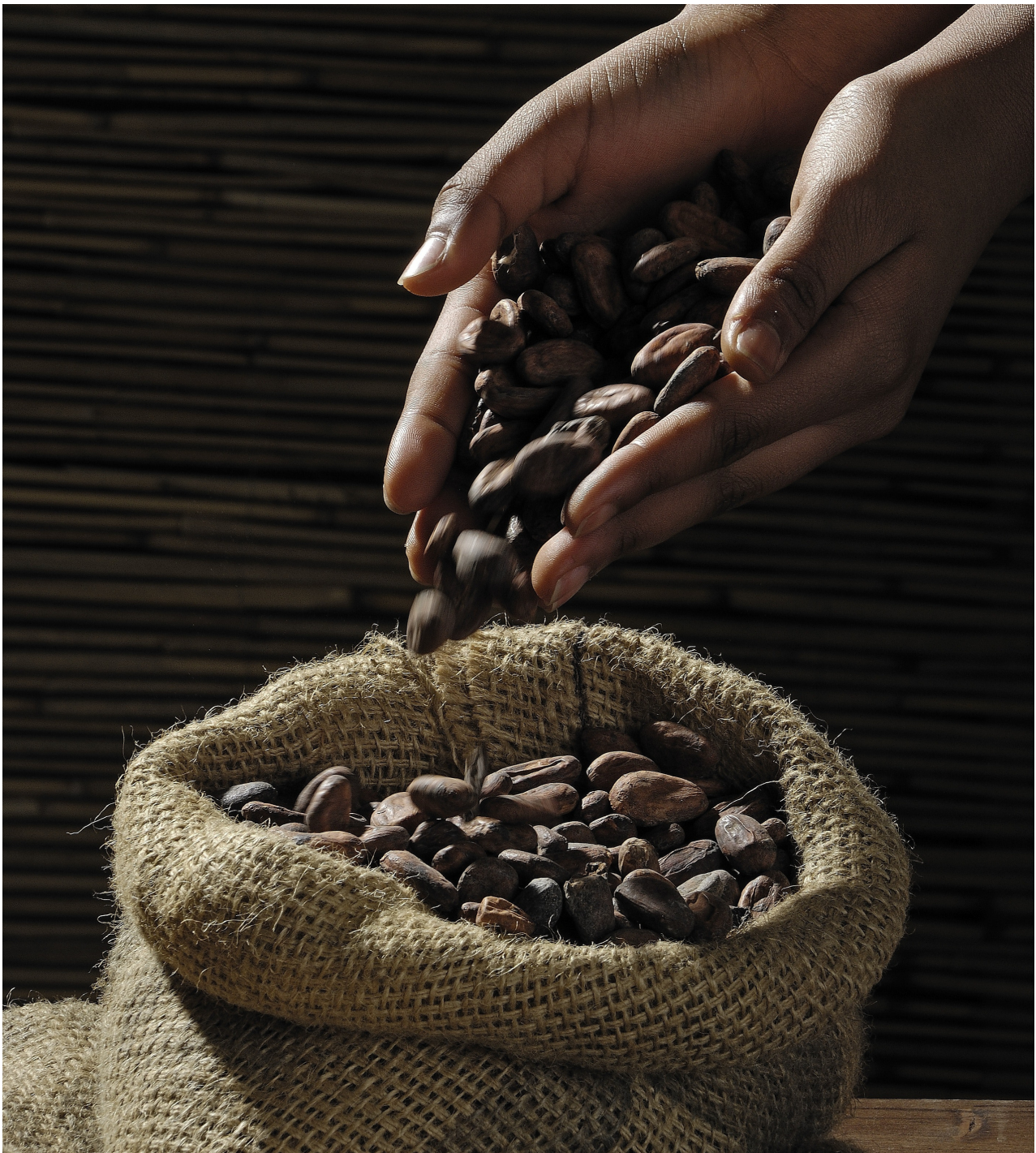
Roasting coffee beans adds value to the incomes of small-scale coffee farmers