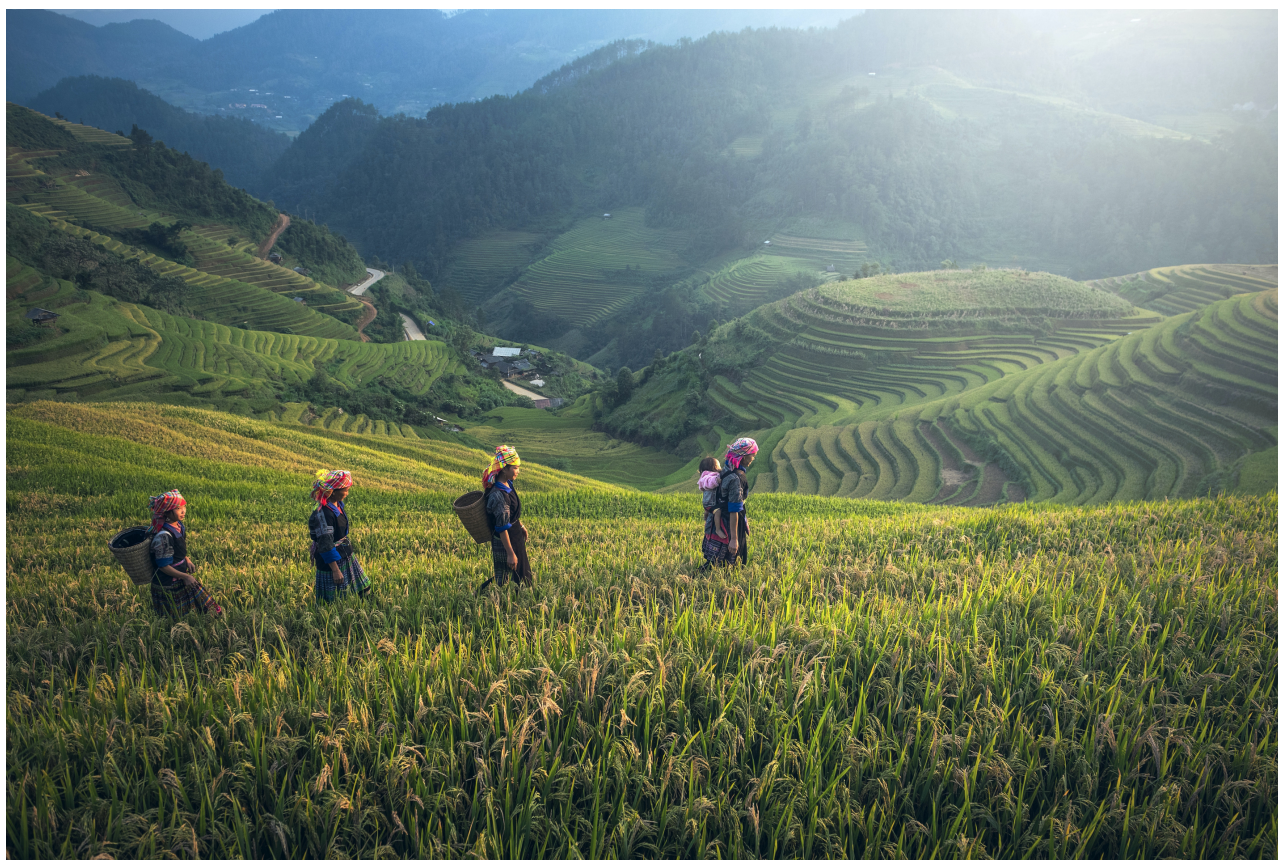
Indigenous women farmers care for their children even as they work in their farms